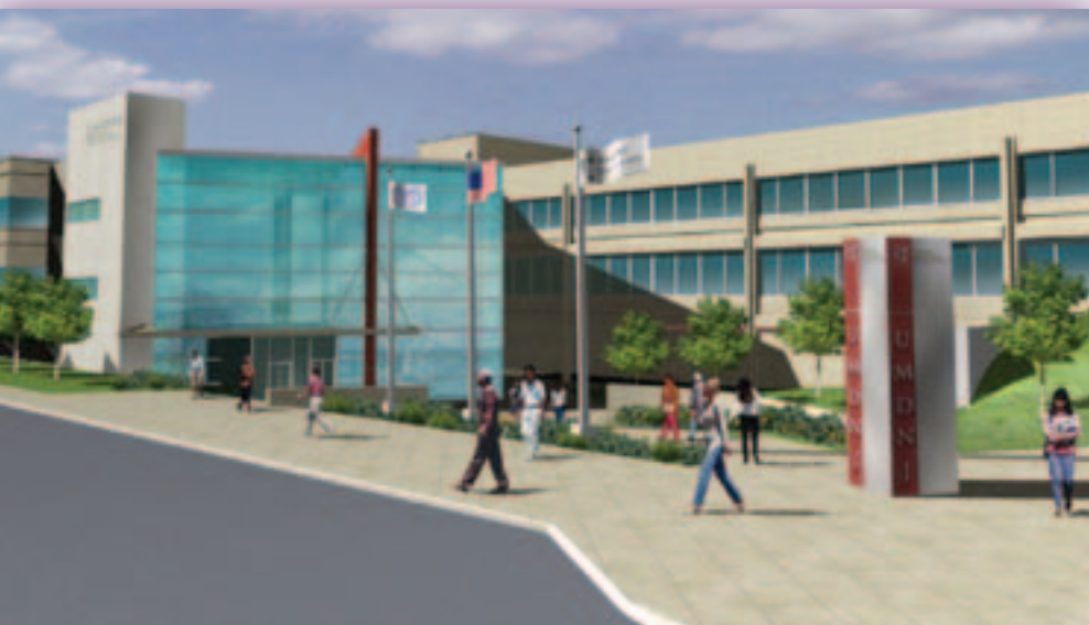
12th Avenue entrance to the new pavilion.